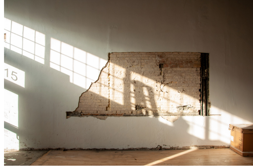
Exposed brick and finished hardwood floors